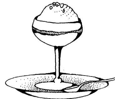
HELADO DE PINA (Pineapple Ice)

1 big ripe pineapple 1 tray of ice 1 ½ cups of sugar 1 teaspoon of lemon juice (optional)